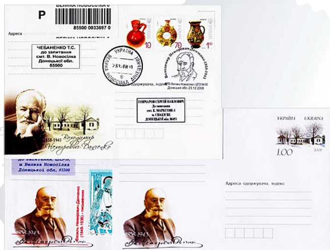
illustration 11– illustration 13

It is appropriate to cite cases of the use of personal seals on written items by the chiefs of annual expeditions at the Ukrainian Antarctic station "Academician Vernadskyi". Each head of the next expedition had to act as the head of the Antarctic post office. The forwarding of postal items was confirmed by his personal seal on the free space of the address side of the envelope (illustration 14).